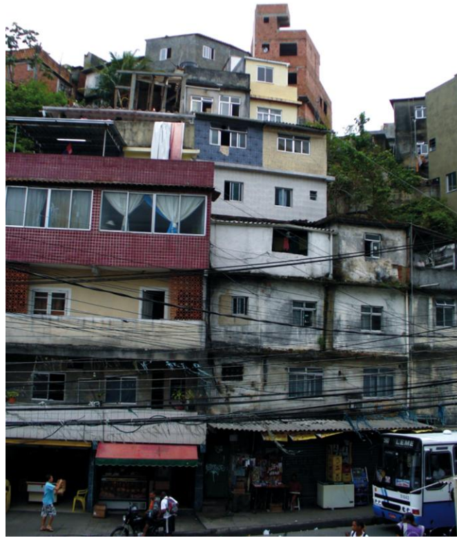
Rented houses in the Gávea Highway.