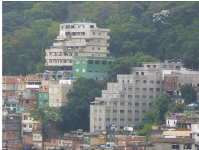
A building nine floor high: the Empire State of Rocinha

Associated to the transformations in the house production process, we must point the appearance of an expressive informal real estate market: in 2002, four estate agents operated in Rocinha – offering rental, acquisition and sale services. One of them, named Pasárgada, manages the properties of 280 customers who owned about 400 rented houses. When the conditions of real estate transactions in the slum are analyzed, the most significant difference among what happens in the official city is connected to the land property: almost all of the properties marketed in Pasárgada are not legalized.