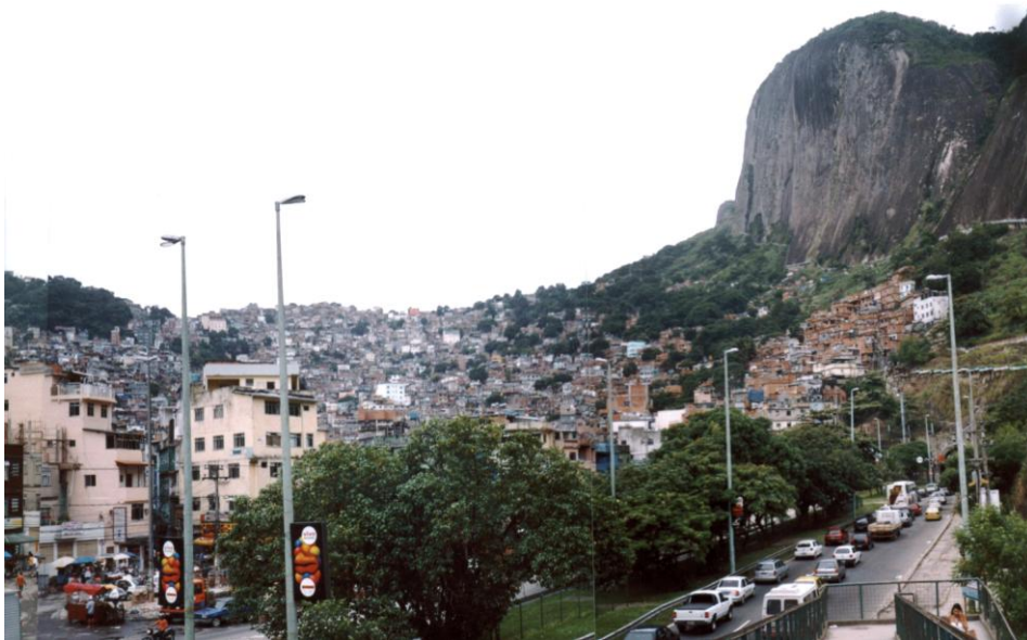
The lower part of Rocinha, close to new Lagoa-Barra highway.

structuring, with the displacement of the area once defined as the centre of Rocinha - due to the concentration of services and commercial activities - initially located along the Gávea Highway to the lower part of the slum, close to new Lagoa-Barra highway. In the 1990s, the expansion of Rocinha is extended: the different "neighbourhoods" in the community see the vertical growth of existing houses with the addition of new floors while other areas near the original slum are occupied, with the creation of new sections, such as the Vila Cruzado and Vila Verde areas.